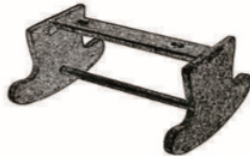
B x 1 pc