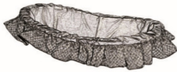
A x 1 pc