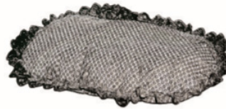
C x 1 pc